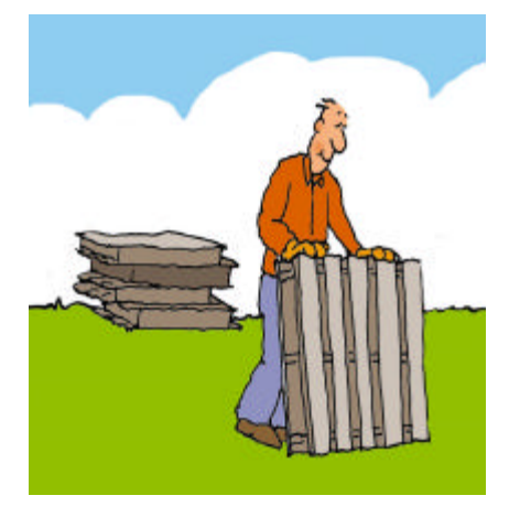
Place one pallet (slat-side up) on level ground. This pallet is the bottom of your bin and will allow for good drainage and aeration by keeping yard trimmings above the ground. Properly drained and aerated compost decomposes quickly and without odors.

Obtain five pallets with narrow spaces between slats (1/2" - 1") and of uniform size. Many pallets measure 40" by 48" and will form a 48 cubic foot capacity bin. Pick up pallets from loading docks, freight companies, hardware stores, central post offices, print shops, wholesalers, nuseries and garden centers. There are always plenty around for free.