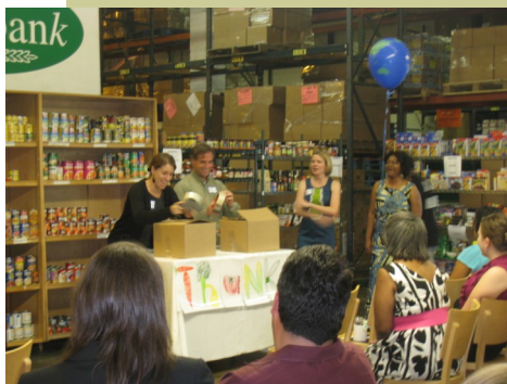
Two brave volunteers participated in our packing