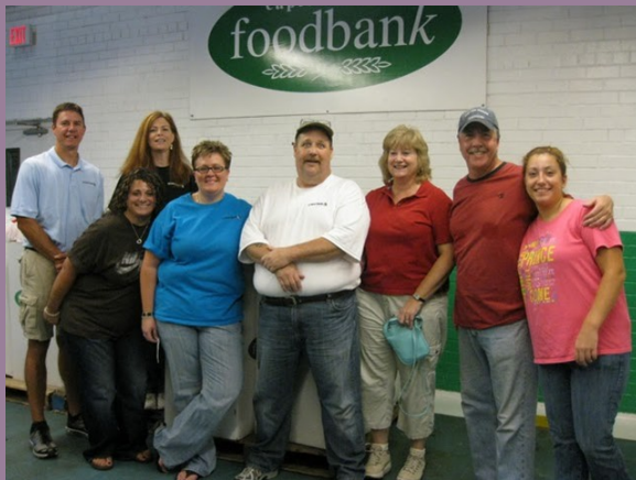
Choptank Transport volunteers