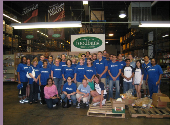
Corporate Volunteer Group of the Year— Deloitte Consulting, LLP