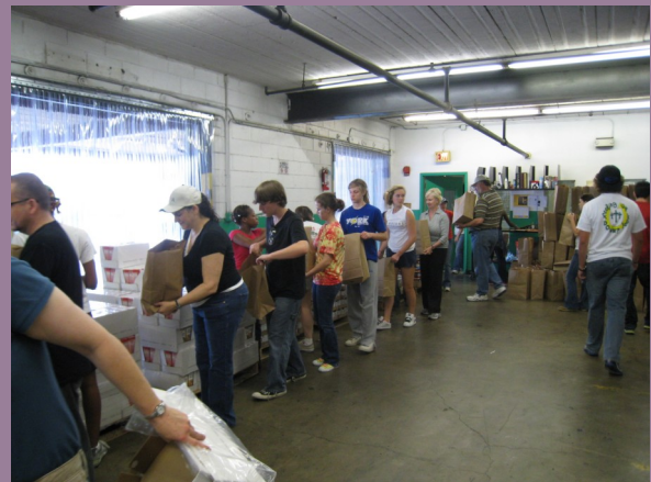
A group of Saturday volunteers packing Senior Brown Bags