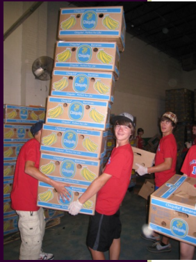
Saturn Road volunteers showing their strength with banana boxes.

Every summer the food bank can almost guarantee to have a group of volunteers from the Saturn Road Church of Christ in Garland, TX.