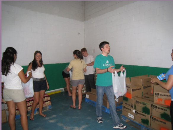
White House interns help prepare Weekend Bags