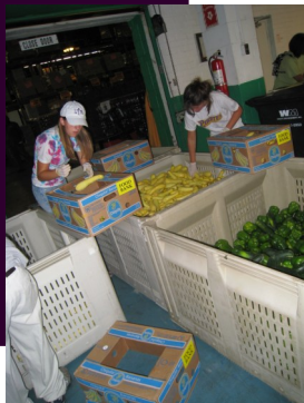
A volunteer inspects and packs squash.

Over the past few months, the food bank has had an increase of fresh produce, like cucumbers, zucchini and cherry tomatoes