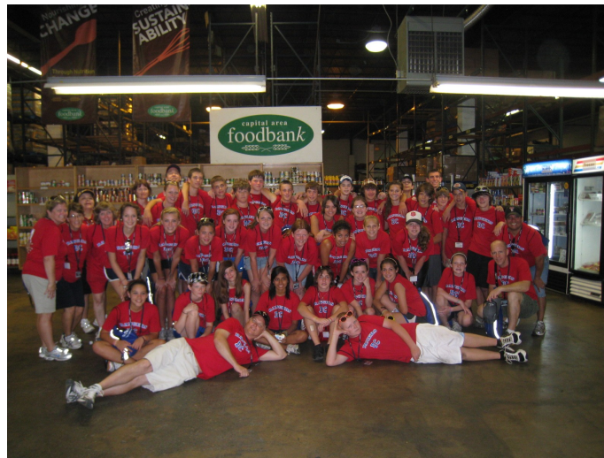
Saturn Road volunteers pose after a long day of volunteering and singing.

We are so thankful for groups like Saturn Road who consistently show their commitment to the food bank. It's because of the dedication of volunteers like these that the food bank is able to provide assistance to a community that is in great need.