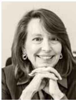
NANCY E. ROMAN