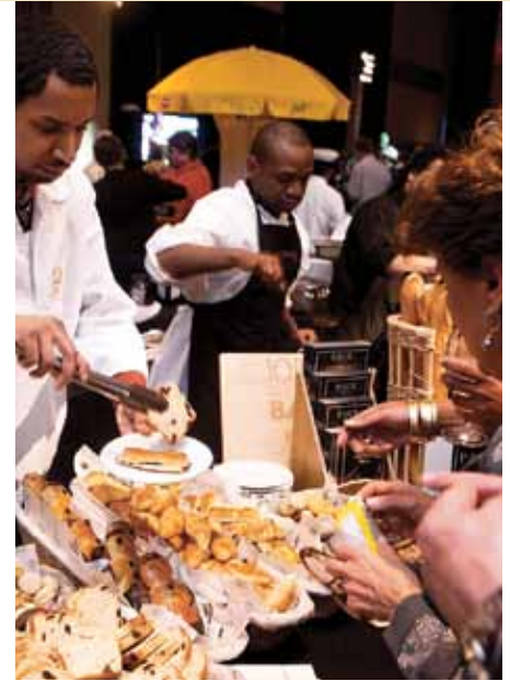
More than 800 guests filled the ballroom at the Marriott Wardman Park Hotel for the Capital Area Food Bank's 9th Annual Blue Jeans Ball.