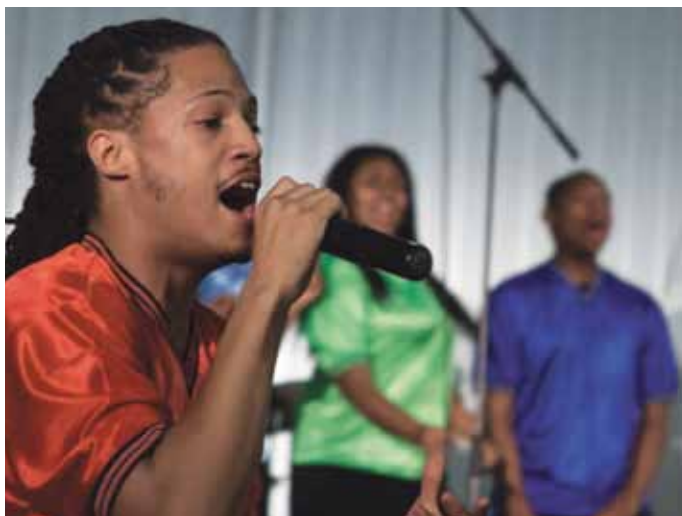
The Urban Nation Hip Hop Choir entertained supporters and donors during the CAFB's Open House event.