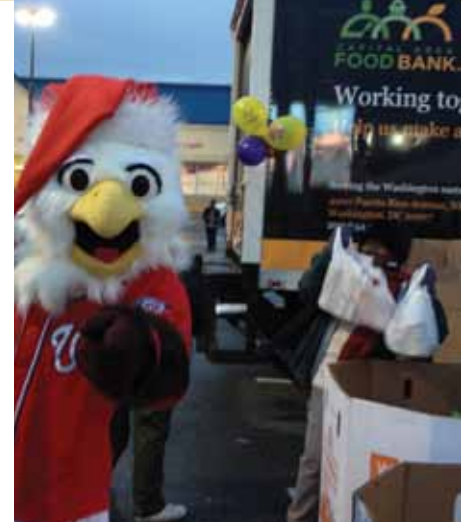
Washington Nationals Mascot Sreech encouraged public support for the food bank's 10th Annual Stuff-A-Truck food drive.