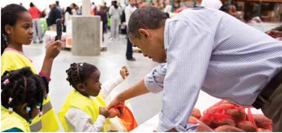
President Obama tops off holiday bags with fresh vegetables, which the food bank provides to help families prepare healthy and affordable meals.