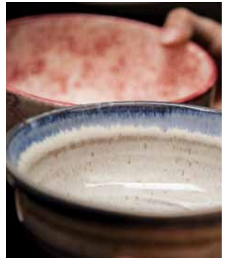
The food bank's 4th Annual Empty Bowls brought together chefs, local artists and members of the community to help feed families, children and seniors struggling with hunger.