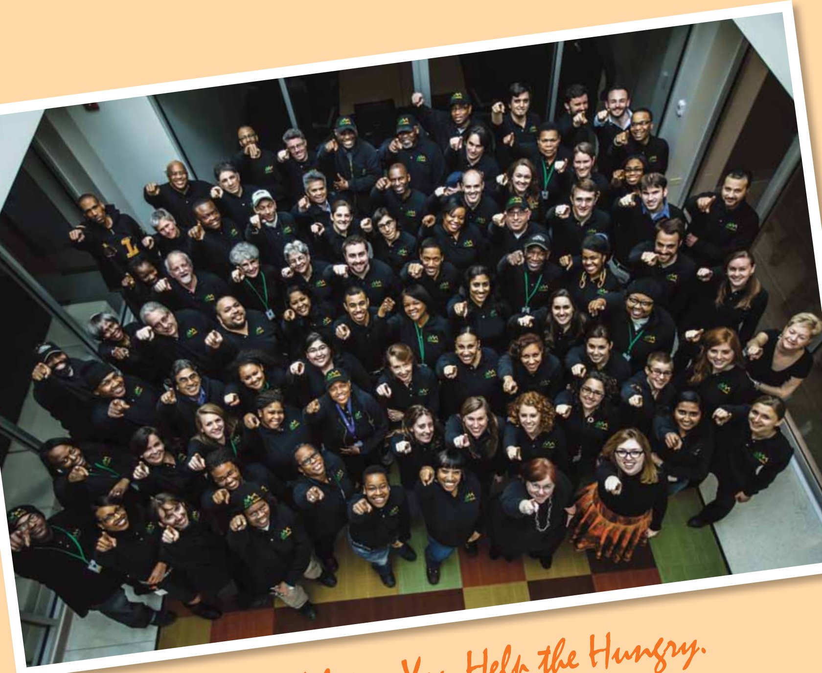
CAFB staff: Helping You Help the Hungry.