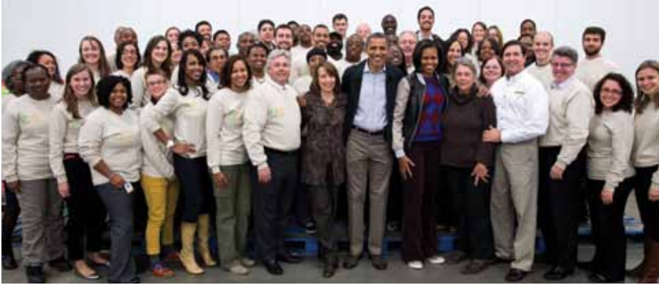
President Obama and the First Family stopped by the food bank the day before Thanksgiving.