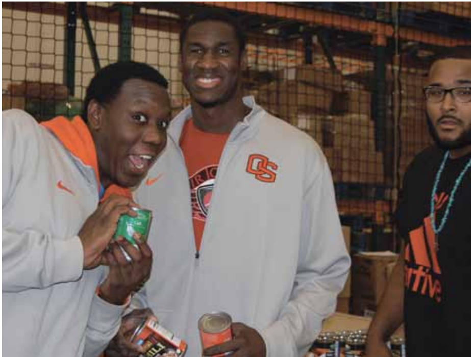
Members of the Oregon State Basketball Team take a break from packing bags for children and seniors during their pre-Thanksgiving visit to the CAFB.